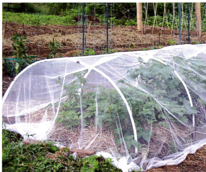
A row cover will keep aphids away from plants.