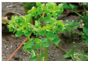
Petty spurge Euphorbia peplus