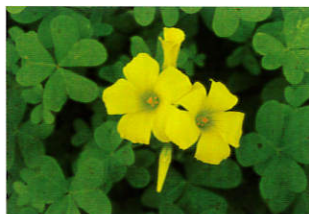
Sourgrass Oxalis pes-caprae

A "weed" in the garden is usually just a plant growing, and often spreading, in the wrong place. Depending on your point of view, "Weeds" is a category that can include not only plants like dandelions and crabgrass, but also the tomato seedlings that burst forth from compost spread on a flower bed.