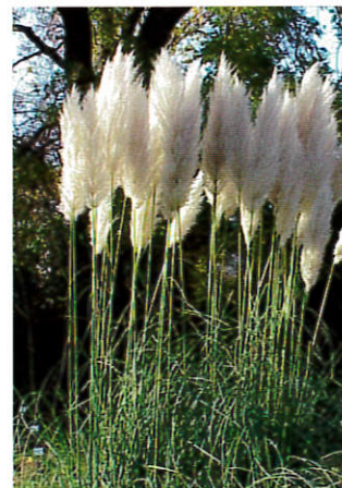
Each pampas grass ( Cortaderia species) flower head can produce up to 100,000 seeds that are easily spread by wind.

Weeds are easiest to pull—by hand or with a weeding tool—when plants are young and the soil is moist, but not wet. If they haven't flowered, and if the weed plants don't reproduce from plant fragments, tubers, or bulbs, you can put them in your compost.