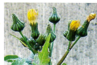
Sowthistle Sonchus oleraceus

weeds in our state, visit the California Invasive Plant Council's website, www.cal-ipc.org .