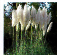
Pampas grass Cortaderia selloana

For a list of more plants to avoid, go to the California Invasive Plant Council Website: www.cal-ipc.org/paf/