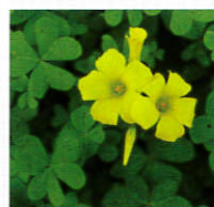
Sour grass Oxalis pes-caprae