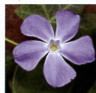
Periwinkle Vinca major