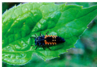
Juvenile ladybug (larva)