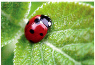
Lady beetle (ladybug)

Beneficial insects are the ultimate non-toxic pest control. And they do all of the work for you! Soldier beetles, syrphid flies, and ladybugs and their larvae attack aphids. Lacewings will go after just about any insect pest.