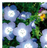
Baby blue eyes

These plants are rich in pollen and nectar, and will attract beneficial insects and pollinators—like bees and butterflies.