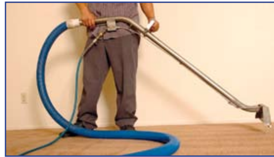
Specialist using a professional vacuum system.