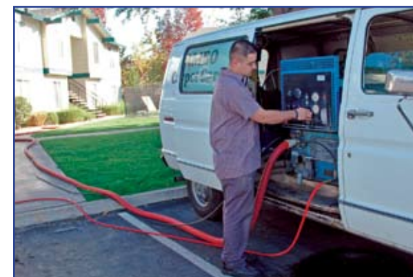
Specialist using a vacuum system to collect wastewater.

► Cleaning products labeled “nontoxic” and “biodegradable” can still harm wildlife if they enter the storm drain system. These products are prohibited discharges to the storm drain system.