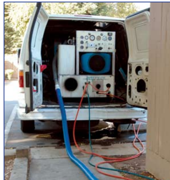
A professional vacuum system collecting wash water.

All carpet cleaners who conduct cleaning operations, which generate wash water must perform cleaning operations based on established best management practices (BMPs). With permission from the sanitary district and the property owner, wash water from