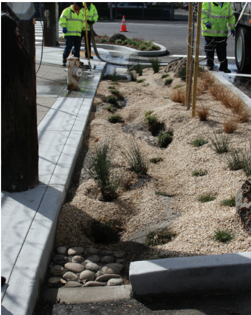
CATCH BASIN FILLED