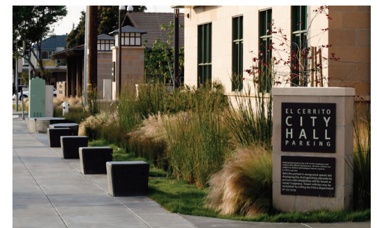
SAN PABLO AVENUE