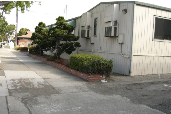
SAN PABLO AVENUE