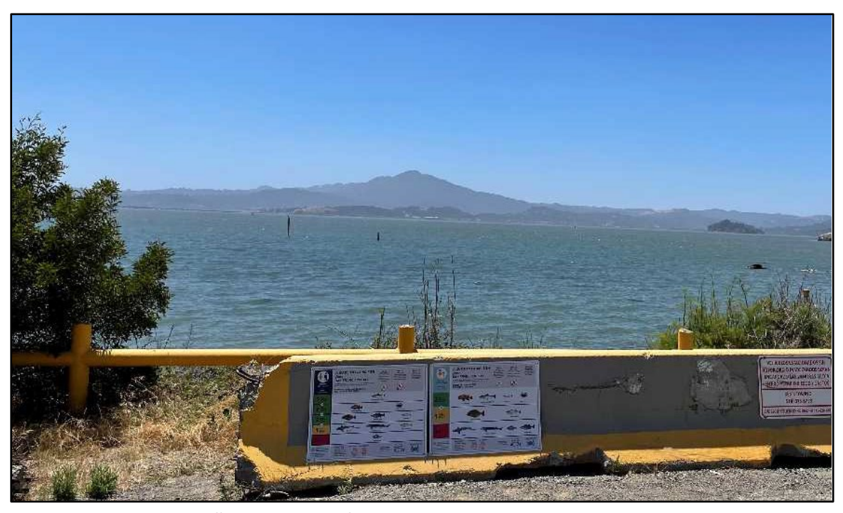
Figure 1. New sign installation at Point Molate- overview