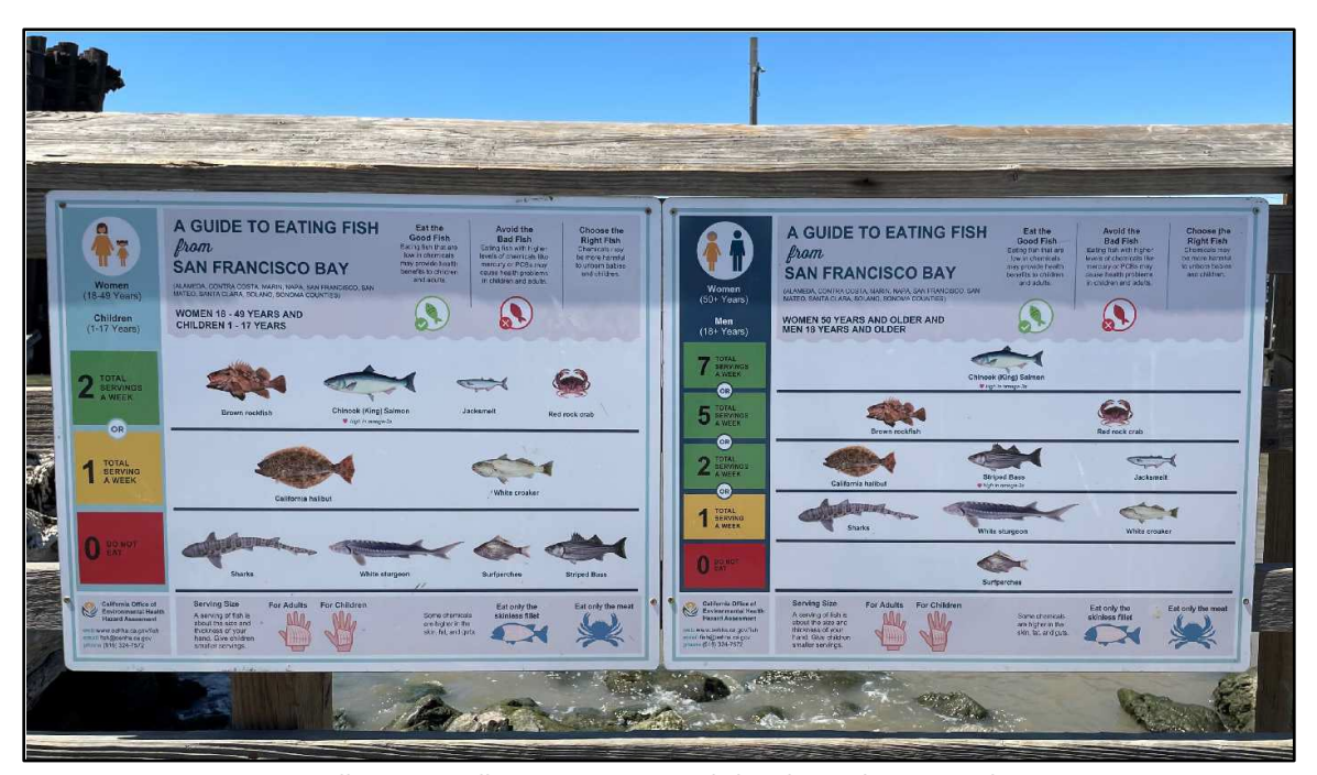
Figure 6. New sign installation at Radke Martinez Regional Shoreline Fishing Pier - closeup