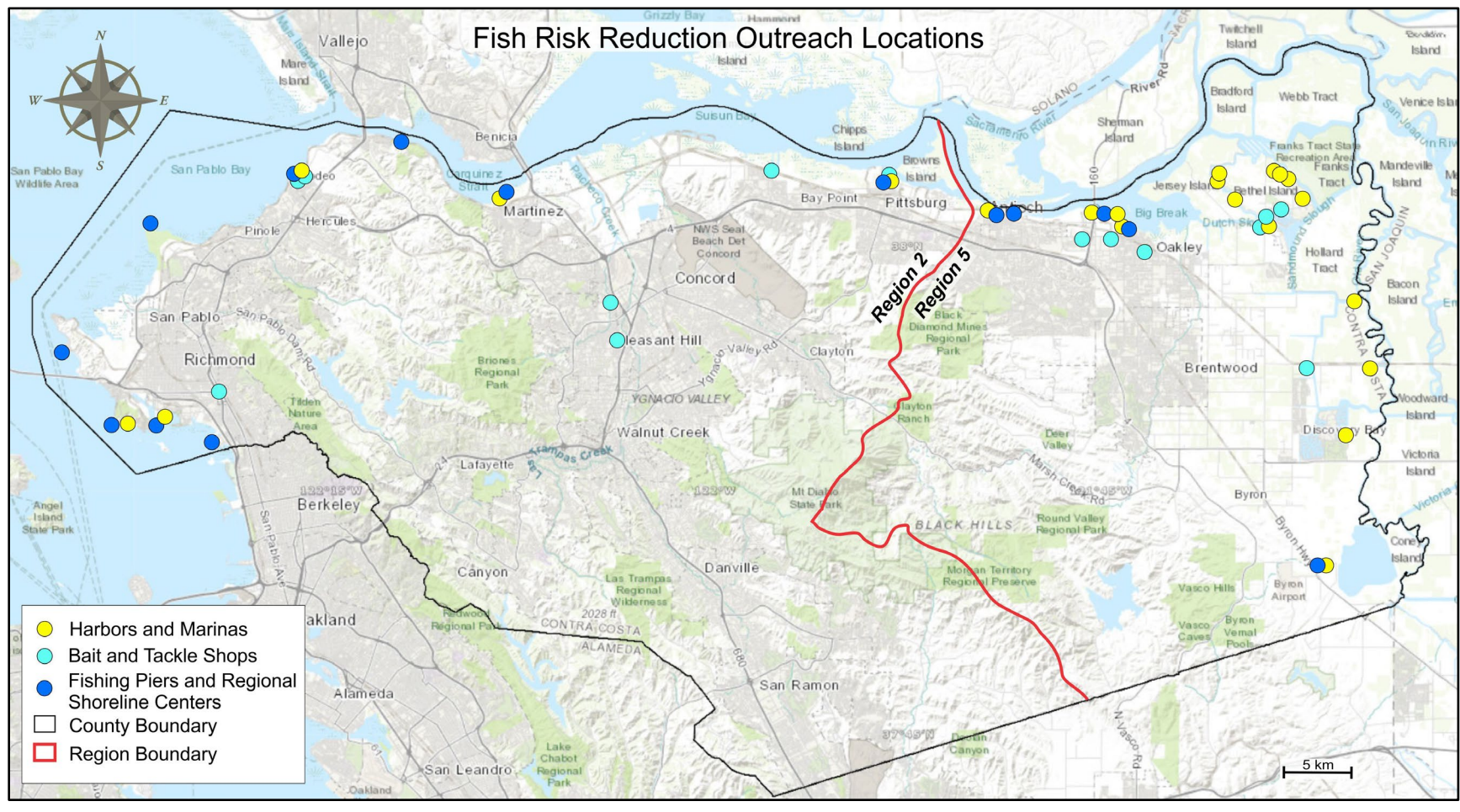
Figure 7. 2022 Fish Risk Reduction Outreach Locations