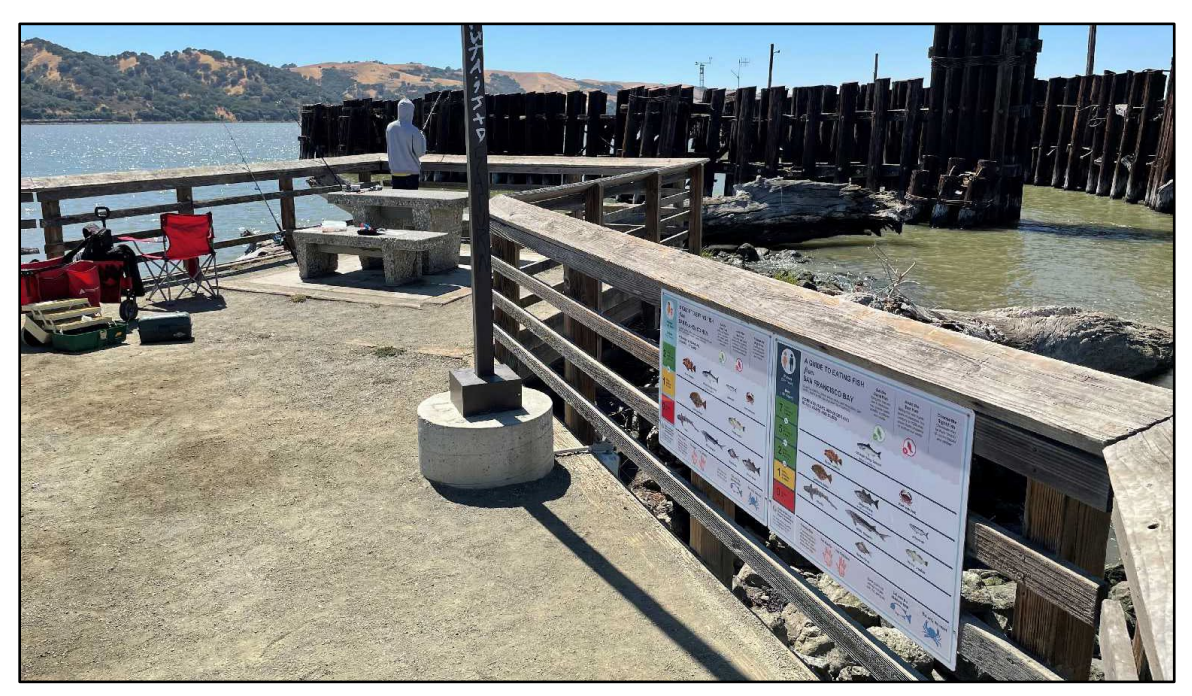
Figure 5. New sign installation at Radke Martinez Regional Shoreline Fishing Pier - overview