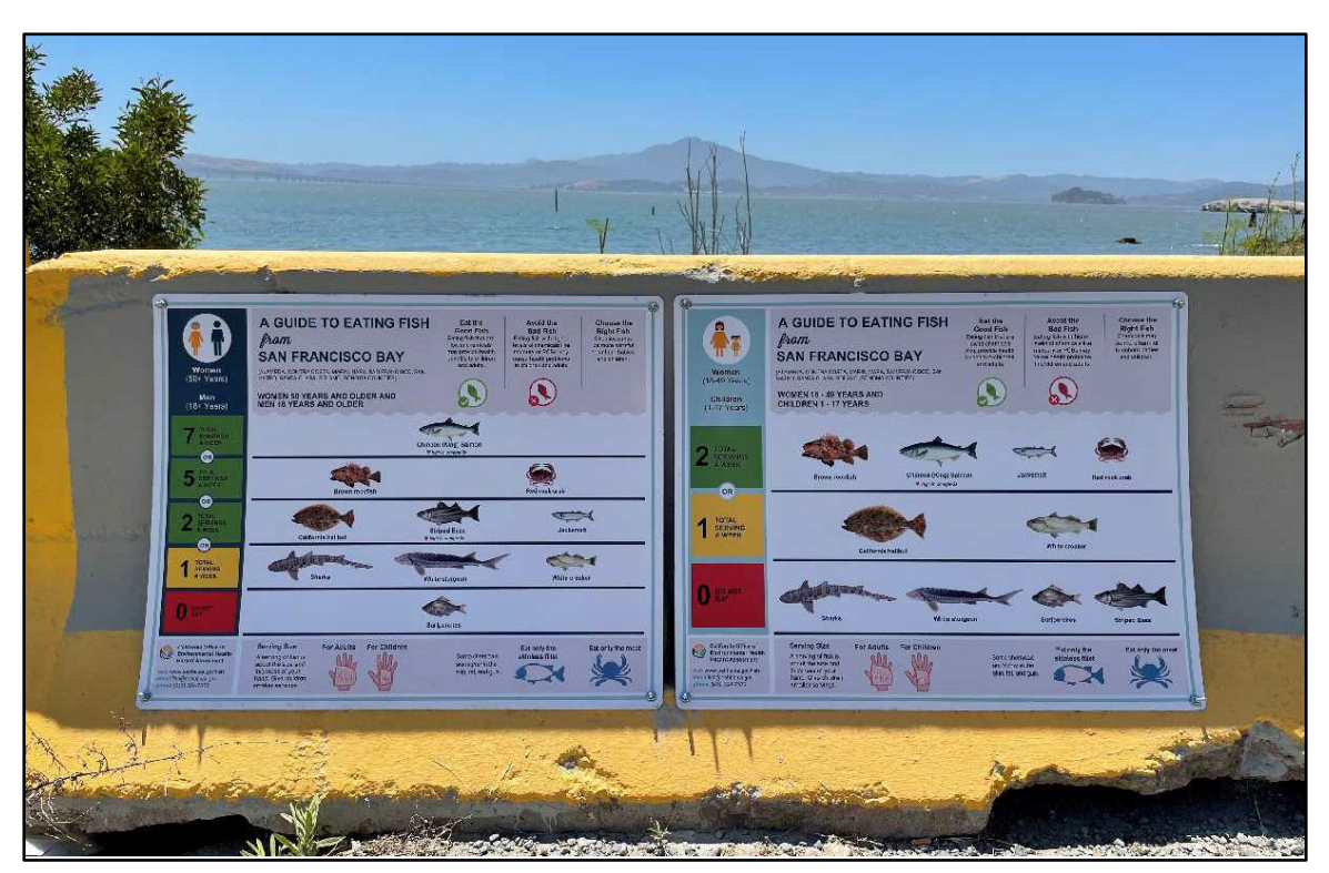
Figure 2. New sign installation at Point Molate – closeup