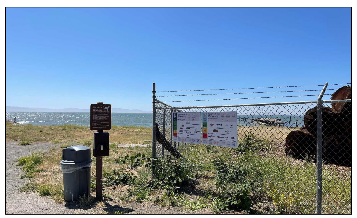
Figure 3. New sign installation at Lone Tree Point – overview