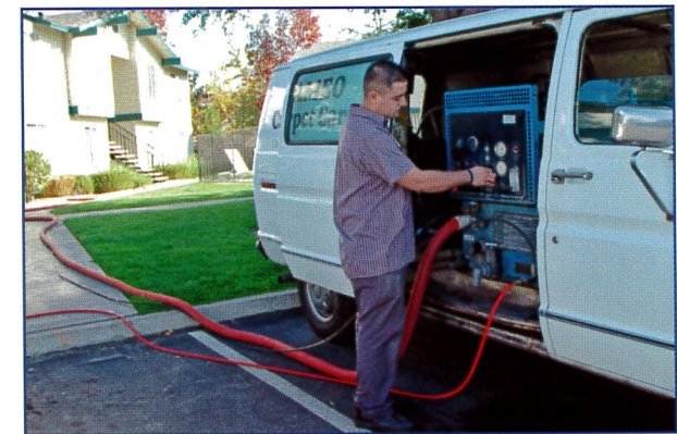
Specialist using a vacuum system to collect wastewater.

► Cleaning products labeled “nontoxic” and “biodegradable” can still harm wildlife if they enter the storm drain system. These products are prohibited discharges to the storm drain system.