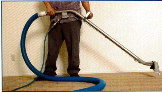
Specialist using a professional vacuum system.