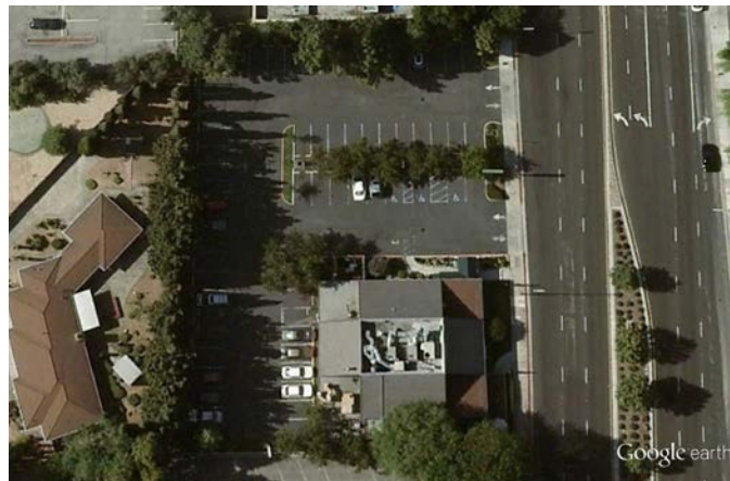
Figure 2. Existing Site Conditions.

Existing significant trees around the perimeter of the site are to be preserved. The landscaped setback areas surrounding the trees will be expanded to the extent practicable, given project parking and circulation requirements, to reduce impervious area of the project. Landscaping in these areas will be upgraded to maximize aesthetic value and ensure the continued health of the mature trees.