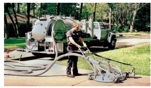
Specialist using a recovery system.