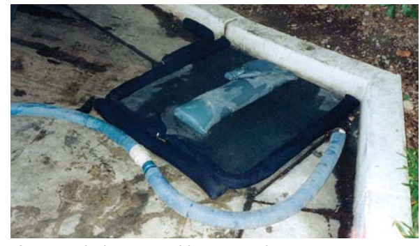
A storm drain cover with vacuum hose.