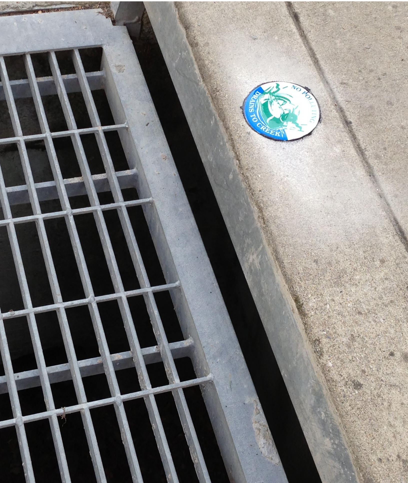
Attachment - C.7.a.iii Storm Drain Inlet