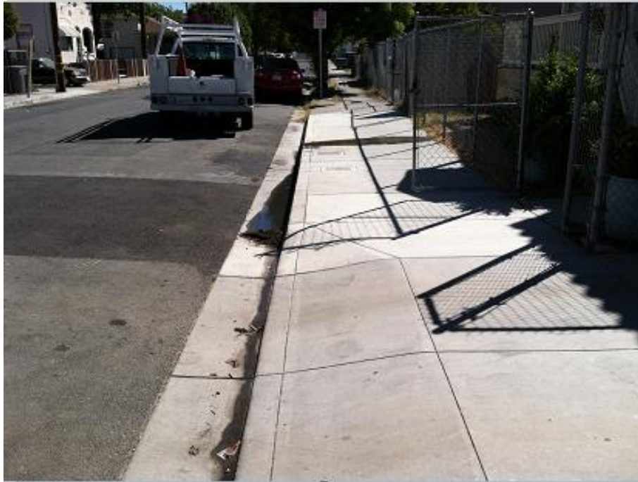
SEWAGE OVERFLOW ONTO PUBLIC STREET AND GUTTER